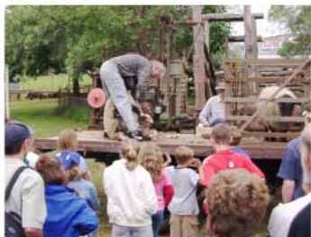
Hand Shearing at Highfields Pioneer Village

Australia Day on the 26th of January is celebrated with enthusiasm at the Highfields Pioneer Village (Highfields) and Centenary Park (Crows Nest) with a variety of activities.